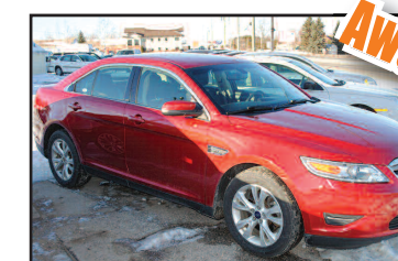
2012 FORD TAURUS SEL Hard to find AWD, one owner. Beautiful car. AS LOW AS $224 A MONTH