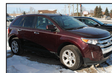
2011 FORD EDGE SEL Leather, loaded. AS LOW AS $249 A MONTH