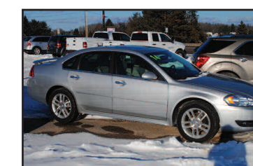
2014 CHEVY IMPALA LTZ Leather, loaded, moonroof. Only 13 K. AS LOW AS $249 A MONTH