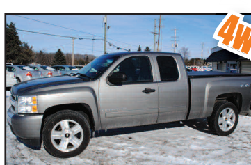
2008 CHEVY SILVERADO LT 4x4, ext. cab, tonneau cover, bedliner, tow pkg, seats 6. Sweet truck. AS LOW AS $199 A MONTH