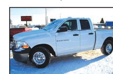
2011 DODGE RAM 1500 CREW CAB Seats 5. Great truck. AS LOW AS $199 A MONTH