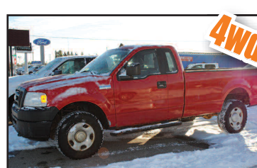
2006 FORD F-150 4x4, bedliner, tow pkg. AS LOW AS $199 A MONTH