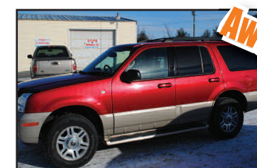
2005 MERCURY MOUNTAINEER AWD, V-8, Leather. AS LOW AS $199 A MONTH

989 VFW RD., CHEBOYGAN, MI • 231-627-6700 • WWW.RIVERAUTO.NET