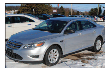
2011 FORD TAURUS One owner, good MPG. AS LOW AS $199 A MONTH