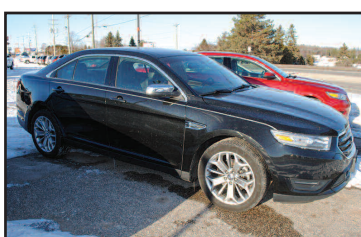
2013 FORD TAURUS LIMITED Loaded. AS LOW AS $249 A MONTH