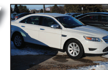
2011 FORD TAURUS. One owner, nice. AS LOW AS $199 A MONTH