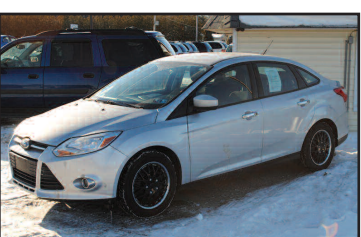
2012 FORD FOCUS 36 MPG, nice car. AS LOW AS $199 A MONTH