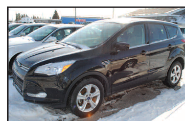
2013 FORD ESCAPE SE Ecoboost, all the extras. AS LOW AS $249 A MONTH