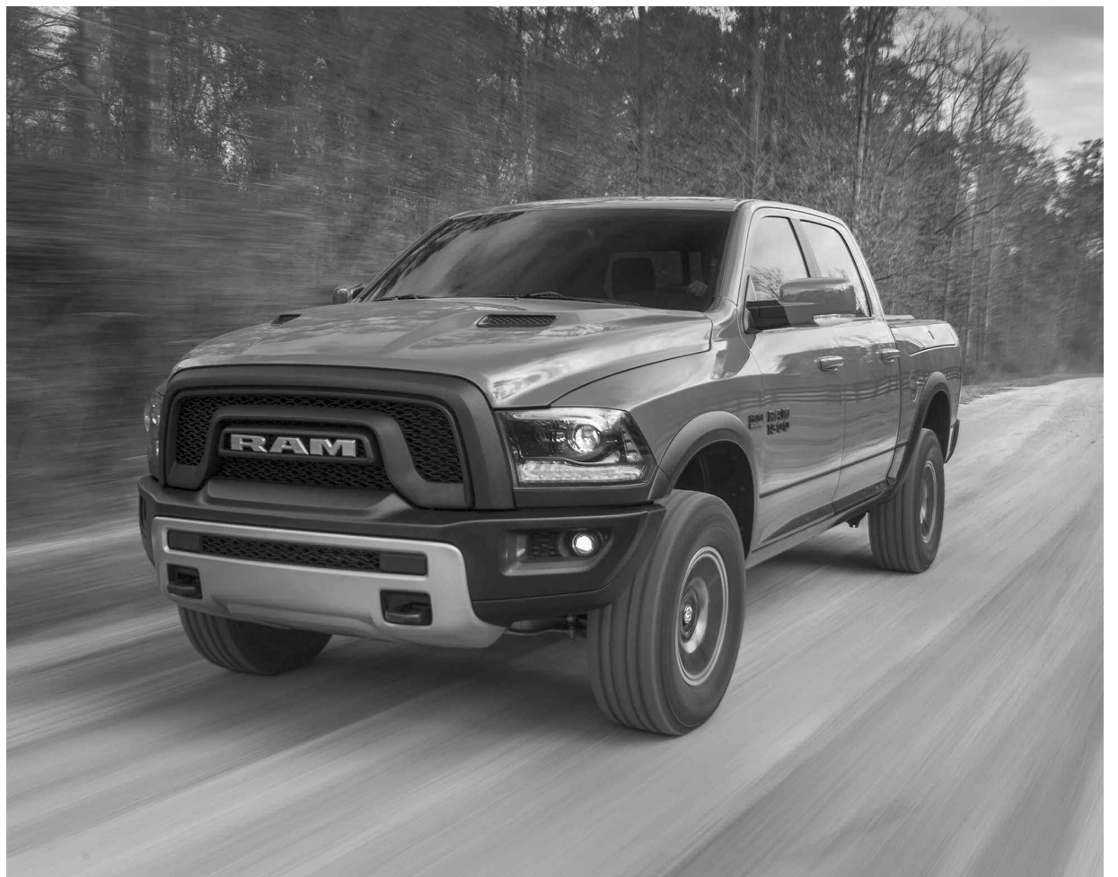
The new 2015 Ram 1500 Rebel brings a one-of-a-kind off-road design to the full-size truck segment.