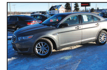
2013 FORD TAURUS Just like new. AS LOW AS $239 A MONTH