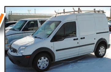
2010 FORD TRANSIT CONNECT Roof rack, lots of cargo room with good MPG. AS LOW AS $199 A MONTH